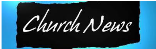
Photo Directory Update